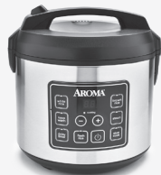
Multicookers/ Rice Cookers