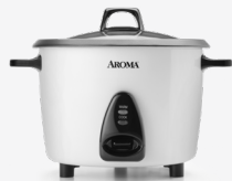
Pot-Style Rice Cookers